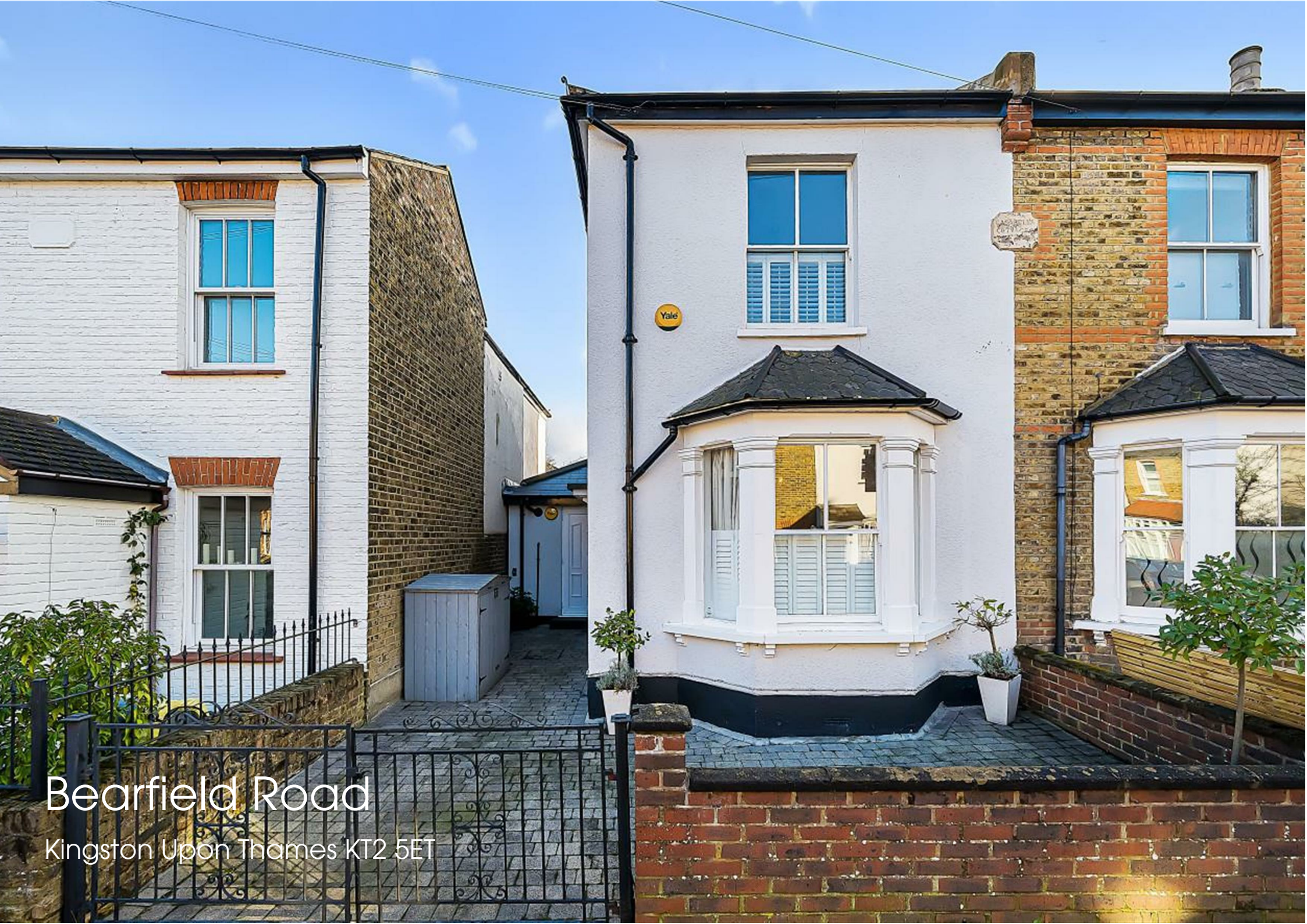
Bearfield Road Kingston Upon Thames KT2 5ET

34 Richmond Road Kingston upon Thames Surrey KT2 5ED www.gibsonlane.co.uk Tel: 020 8546 5444